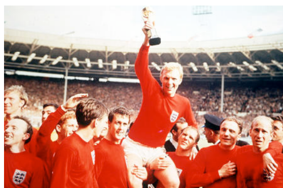
England captain, Booby Moore with the World Cup Trophy